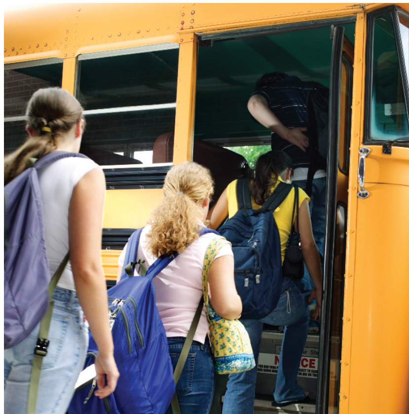
It's back to school time again... and the biggest portion of back-to-school budgets will go toward apparel and accessories.

grown in the last few years. 37 percent of parents said they will compare shop online and in stores more often to get the best deal.