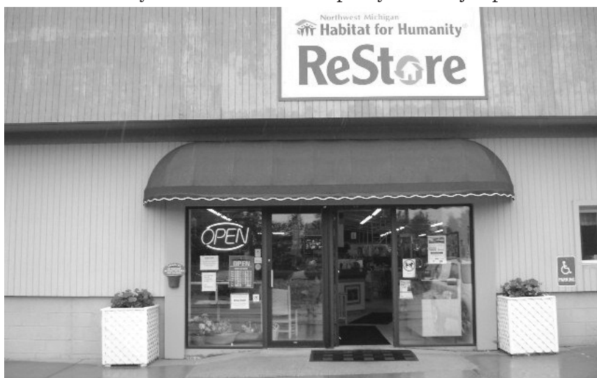
HarborHabitatRestorePhoto; Customers shopping at the Habitat for Humanity Restore facility in Harbor Springs not only enjoy huge savings in price, they are helping to build the new home dreams of the families the Habitat organization helps each year.

majority of the items offered in the store. Since Habitat for Humanity Restore is a non-profit organization, those donations are typically tax-deductible for the donor. Proceeds from the sales at the Restore are utilized to assist affiliate Northwest Michigan Habitat for Humanity build quality, energy efficient, new home for families in Emmet and Charlevoix Counties.